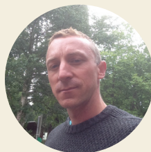
Illustrated by Tommy Doyle