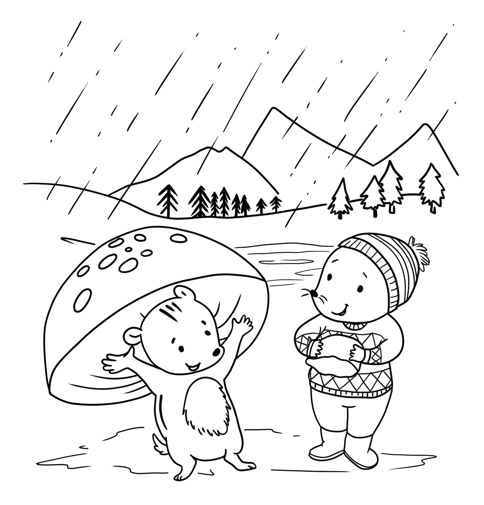
"Thanks, Little Mole. You are so kind!" Little Chipmunk said as she took shelter under the mushroom.