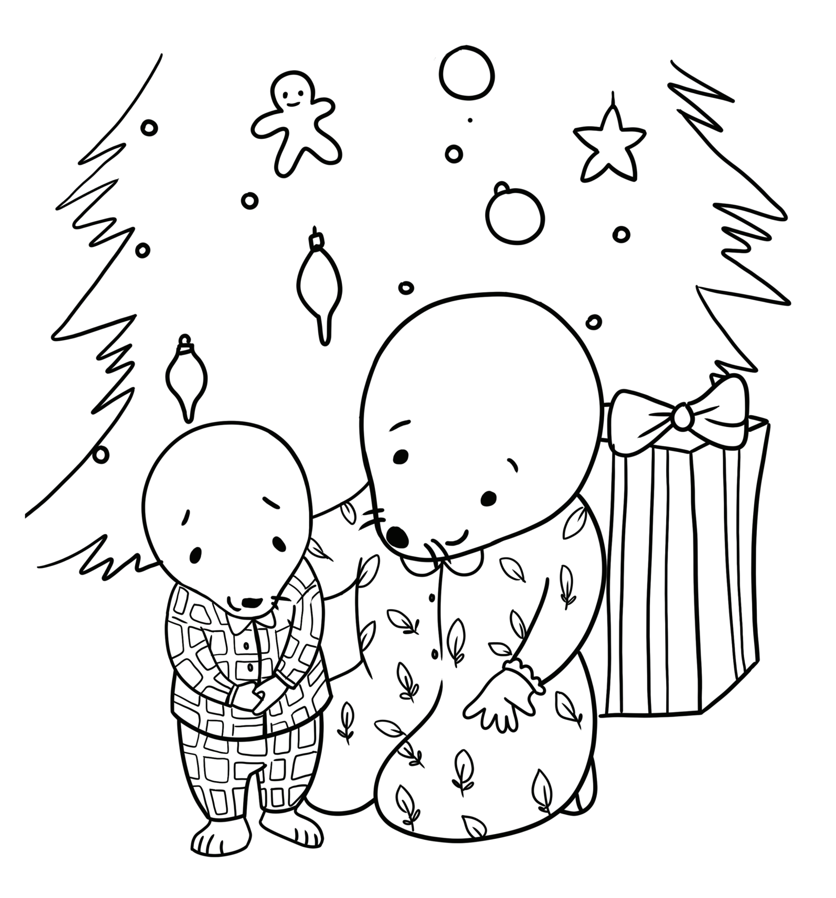
"Little Mole, your kindness is the biggest, most perfect Christmas gift I have ever received."